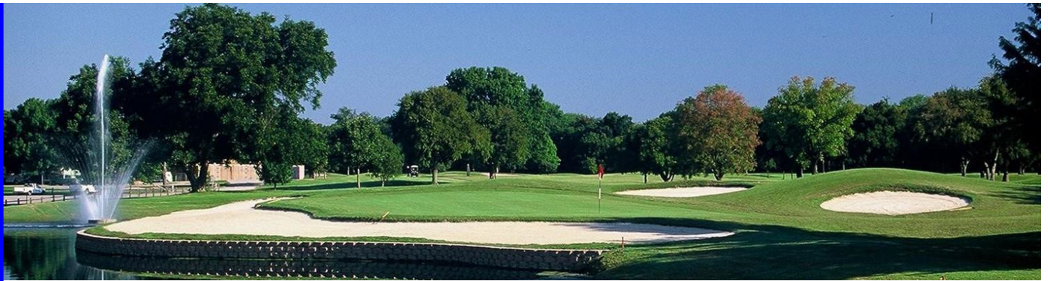
Pecan Valley River Golf Course